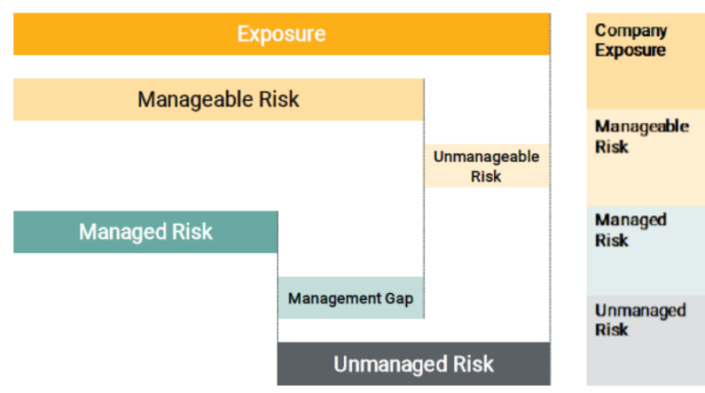
Exhibit 1: Risk Decomposition

Below exhibit illustrates how the unmanaged risk of a material ESG risk factor is computed: